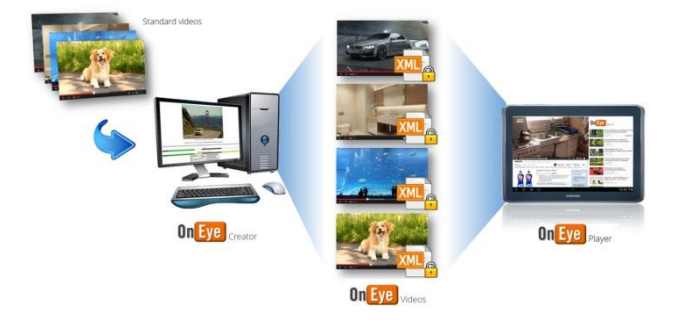
Figure 1: The three components of the OnEye system: OnEye Creator, OnEye Videos and OnEye Player.

In this paper, we introduce tools to create such enriched video content and to present them to the audience in a specific way. We show that a vision based object tracking can help in the generation process, but also that an