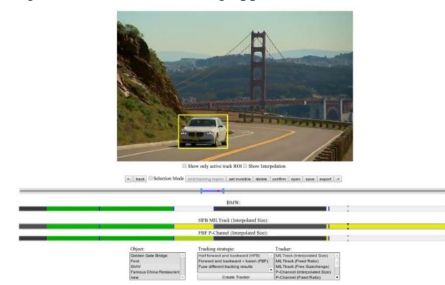
Figure 2: The Graphical User Interface

several frame based editing tools. Further semi-automatic segmentation based tracking approaches that work similar