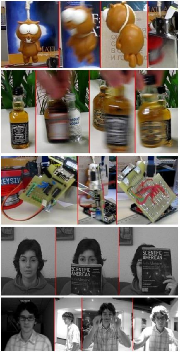
Figure 3: The sequences used in the evaluation. From top to bottom: "Lemming", "Liquor", "Board", "Faceocc" and "David"

In this section we describe our video edition software for object tracking, OnEye Creator. The software consists in a server-side application and a web-based client. The client