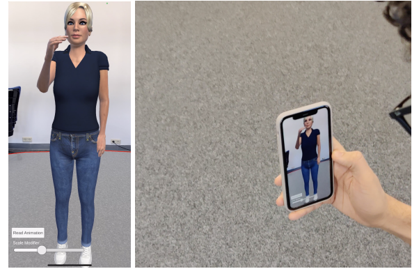
Fig. 3. Preliminary version of the Avatar Player.

Upon the request of the Avatar manager, this module produces an MMS (multi-modal signstream) instance from an input sentence. An MMS consists of a table listing the sequence of glosses to be displayed together with additional information about their composition (e.g., holding, or performing different signs with the two hands) and their inflection (e.g., relocation, eye brows modulation). The detailed description of the MMS (already anticipated in [13]) is a work in progress.