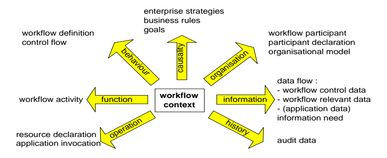
Fig. 3. The Dimensions of the Workflow Context Space.

sented using RDF (resource description framework<sup>3</sup>). RDF allows for expressing properties of resources, their relationships, and defining standardised models of meta-data, i.e., provides means for representing formal ontologies.