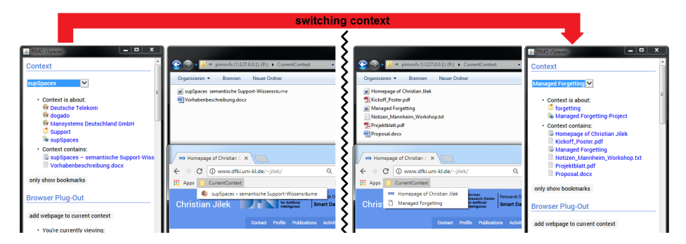
Fig. 2. Screenshot showing sidebar, file explorer and browser before (left half) and after a context switch (right half), illustrating the effects of a dynamic reorganization of the system. (Note: windows were rearranged for easier comparison.)

Demo. In an early proof-of-concept implementation based on [5], we already realized some of the file system, browser and calendar parts. The screenshots in Figure 2 show a typical feature of our system: the user selects a different context