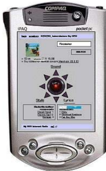
Fig. 3. MYMO: Mobile Music Recommendation Engine

We also demonstrated how this approach can be used in a music recommendation service. Exploiting the semantics of the language behind the artist reviews by using Natural Language Processing techniques could be a possible future work. The goal is to extract as much relevant information as possible from the artist reviews by using the state-of-the-art technologies from the fields of Information Retrieval and Natural Language Processing. We believe that the approach presented in this paper would be well suited for use in a recommendation service to provide quality services to all the music lovers of the world.